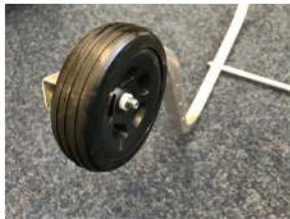
Slide the wheel and spacer over the bolt.