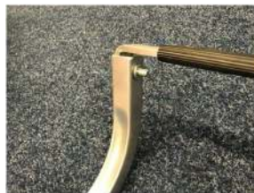
Pass a washer over the end of the bolts