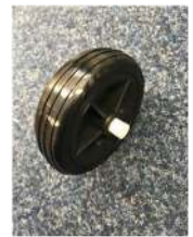
Insert the longer spacer tube into the wheel bore