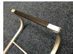
Next, pass the ends of the bearer bar into the other ends of the hooks, aligning the holes.