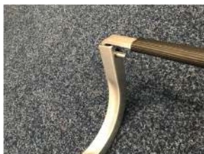
Pass the remaining bolts through these holes.