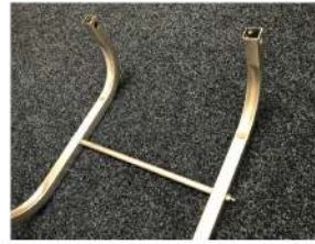
Tighten the nuts onto the ends of the all-thread.