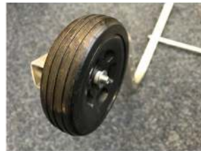
Pass a second washer over the end of the bolt.