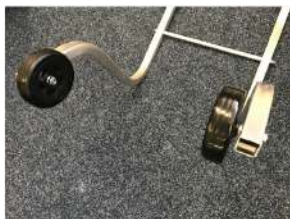
Fit the nuts to the ends of the bolts and tighten, ensure the wheels spin freely.