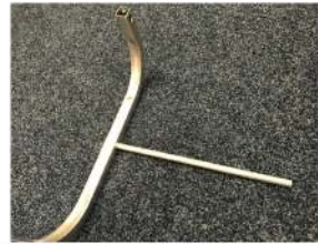
Insert the spacer tube into the large holes inside the hook pieces.