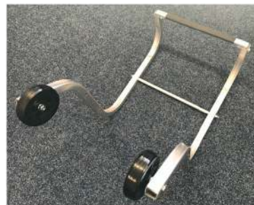
The completed roof hook assembly ready to be fitted to the predrilled ladder- when doing so again ensure not to overtighten.