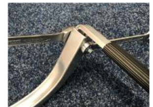
Fit the remaining nuts over the ends of the bolts and tighten, take care not to overtighten.