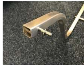
Pass a washer over the end of the bolts