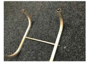
Pass the all-thread through the spacer tube.