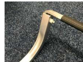
Insert the remaining spacer tubes from inside.