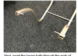
Next, insert the longer bolts through the ends of the hooks from the outside.