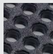
Nitrile Rubber Abrasive Coating