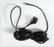
Common Point Grounding Cord with ring terminal - 4.5m