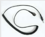
Coil Cord - 1.8m