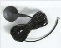
FloorMat Grounding Cord with ring terminal - 4.5m