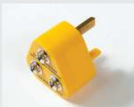
Earth Bonding Plug-