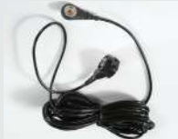
Common Point Grounding Cord with female socket - 4.5m