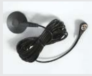
FloorMat Grounding Cord with female socket - 4.5m